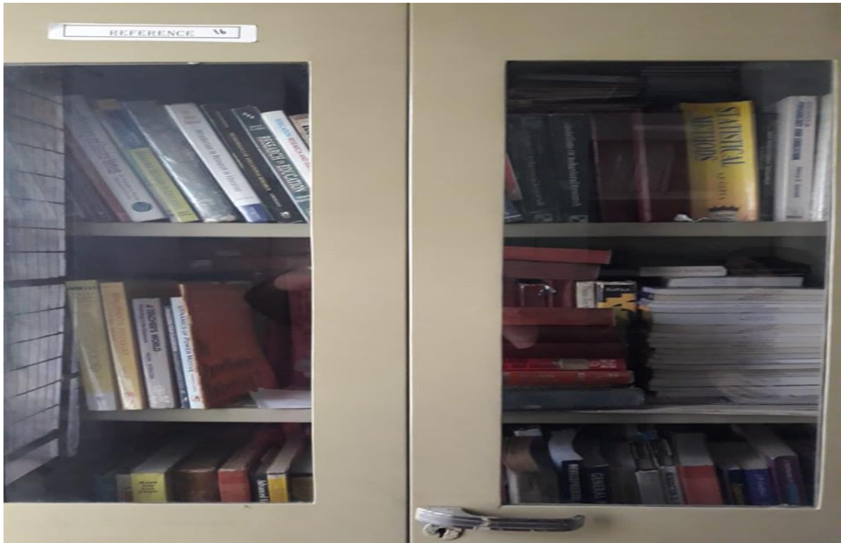
College has a good collection of Titles and reference books on research & Statistics