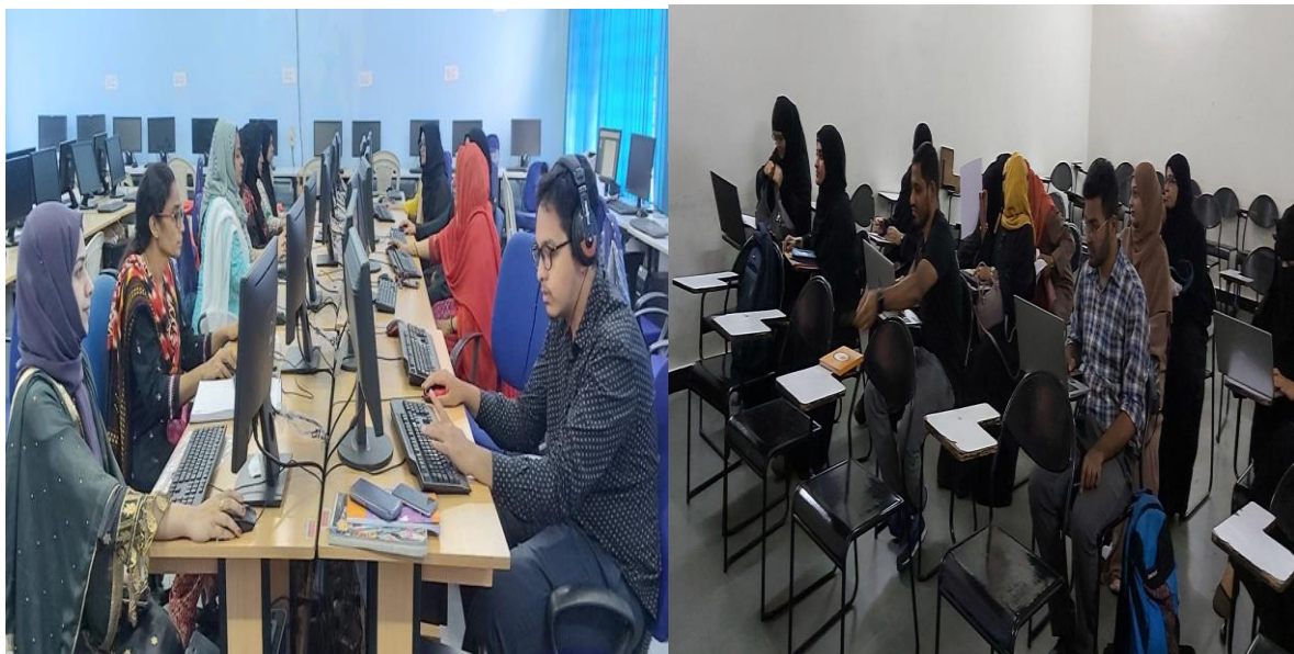
College has a well equipped Computer Lab which is connected to High speed Internet. College also provides WiFi to the staff and students to access the world wide web.